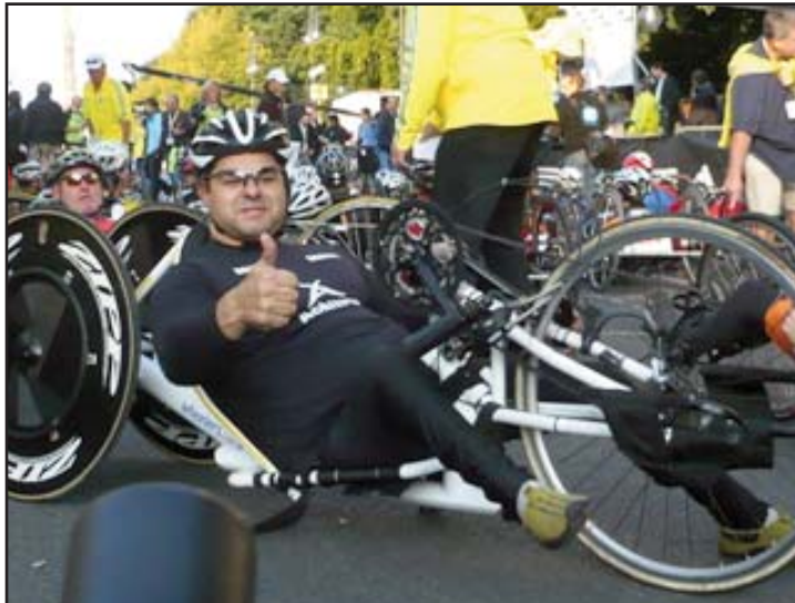
Above: Brazil team member showing he has the right stuff at the Berlin Marathon.