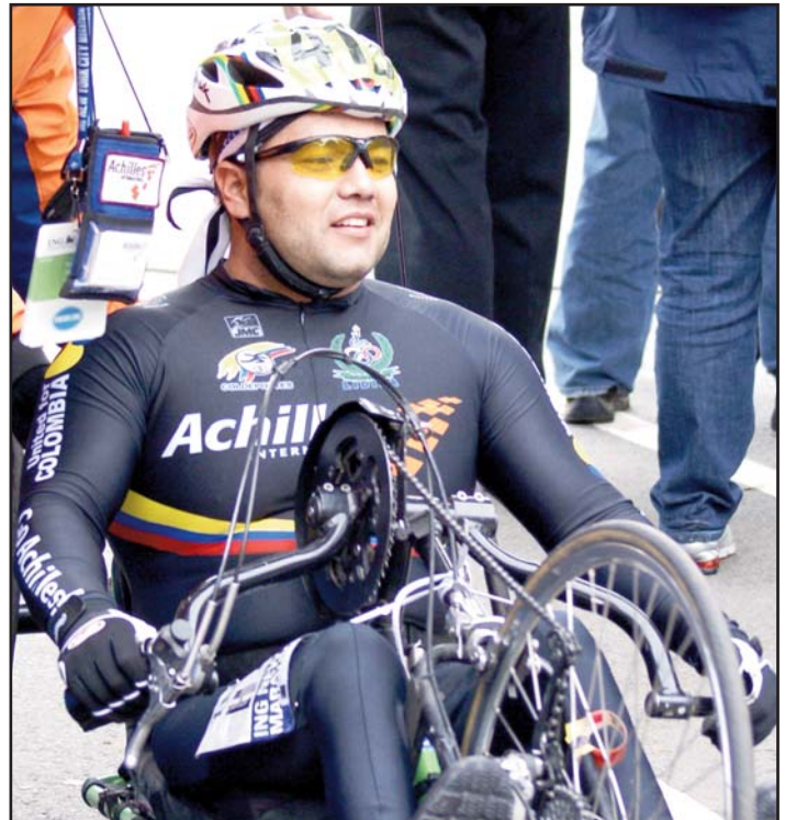
Above: Achilles Colombian member makes it look easy, cruising past the ING NYC Marathon finish line.