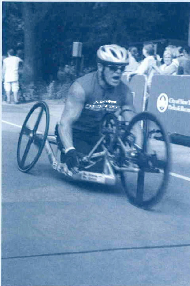
Rolling to a fast finish in Central Park

The SSMAC organized a full weekend of activities and called on an extraordinary group of volunteers from