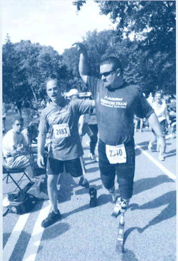
High fives after the race

On August 4th the Union League Club hosted a group of young servicemen and women wounded in Afghanistan and Iraq who came to New York to participate in a five-mile road race staged by the Achilles Track Club. The participants, most of who were single and double amputees, were primarily from Walter Reed Army Medical Center. Our involvement with the program grew out of our relationship with the Soldiers', Sailors', Marines' & Airmen's Club (SSMAC) which has been serving the men and women of the Armed Forces since 1919. SSMAC hosted a group from Walter Reed for the NYC Marathon last year and found themselves unable to accommodate the demand. They asked if we could spare ten rooms and we were happy to do so. The Board of Governors then authorized a complete laying out of the welcome mat for the August event.