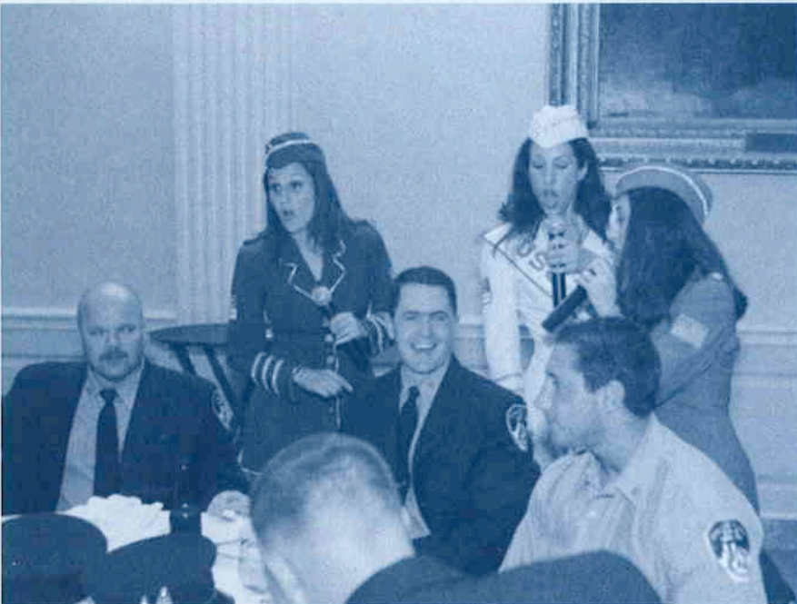
The USO troupe serenades FDNY volunteers at dinner in Lincoln Hall

We provided a hospitality suite and buffet dinner on Friday evening, thirty-two rooms for the soldiers and their family members through the weekend, and a gala dinner on Saturday night complete with a performance by the New York City USO Troupe.