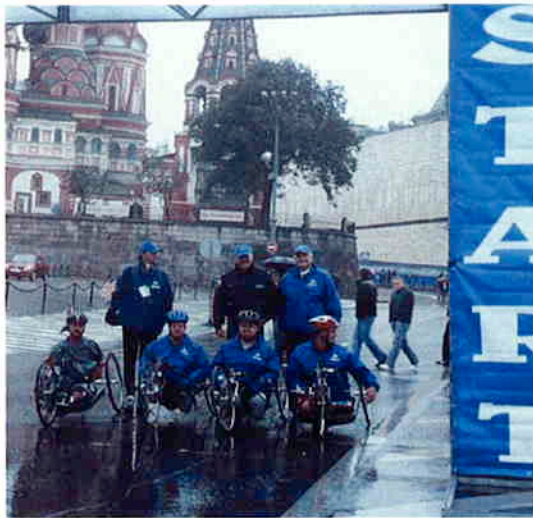
Freedom Team on a cold rainy day at the Starting Line at the Moscow Marathon

The Achilles Track Club – Freedom Team of Wounded Veterans is a running program set up at the Walter Reed Army Medical Center in February 2004, for disabled Iraq and Afghanistan war veterans most of whom are amputees. With the support of coaches and volunteers, veterans learn how to wheelchair, to walk, to jog, and to eventually run. Their rehabilitation is enhanced through physical activity, goal setting and personal achievement all stressed in the marathon program.