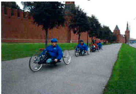
Practice runs around the Kremlin the day before the race

The Achilles Track Club is a not-for-profit organization established in 1983 to encourage disabled people to participate in long-distance running with the general public. It has 60 chapters worldwide and is involved in many local and worldwide running events.