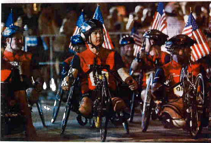
Palm Beach Marathon Starting Line 2006