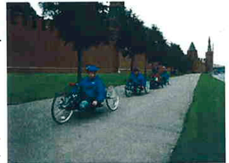
Practice runs around the Kremlin the day before the race

The Globetrotter Marathon Program initiated its program by sending the Achilles Freedom Team of Wounded Veterans to The Moscow International Peace Marathon. Our delegation consisted of four wounded veterans, three of their wives and two members of the Achilles Staff. The traveling team flew direct from Atlanta to Moscow, where the entire 6-day stay was hosted by McDonalds Russia , (accommodations, meals and ground transportation).