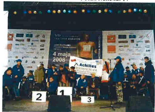
Krakow Awards Ceremony