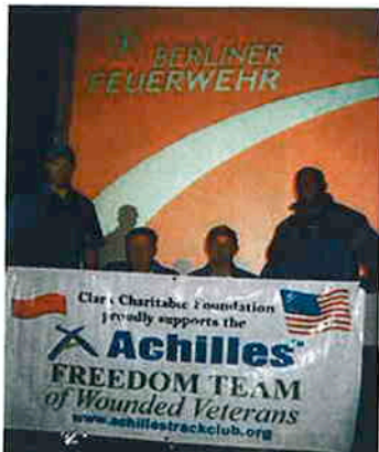
Making a Presentation to the Berlin Fire Fighters