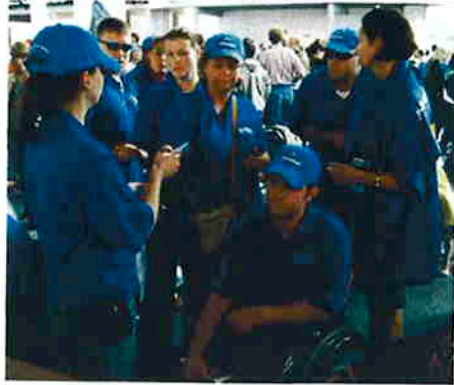
Team Members at Registration Berlin Marathon