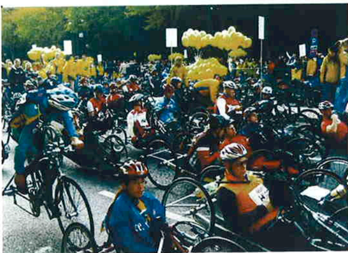
Six members of the Freedom Team at the starting line in Berlin