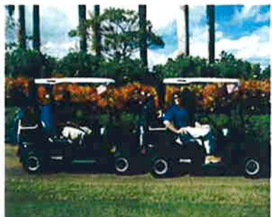
Freedom Team at golf outing, Palm Beach, 2008