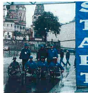
Freedom Team on a cold rainy day at the Starting Line at the Moscow Marathon