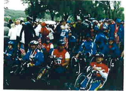
Freedom Team at the starting line

The Clark Charitable Foundation of Bethesda, Maryland, funded our freedom team of wounded Veterans to Poland, consisting of five wounded men and one woman, as well as a traveling staff of three Achilles associated individuals and an interpreter of Polish decent. Our team effort was met with great enthusiasm starting at the airport where the National Polish TV (PTV 3) covered our arrival with great fanfare. The Achilles Track Club has five chapters in Poland that helped pave the way as they have had a presence there for over 20 years. Dozens of their local handicapped racers